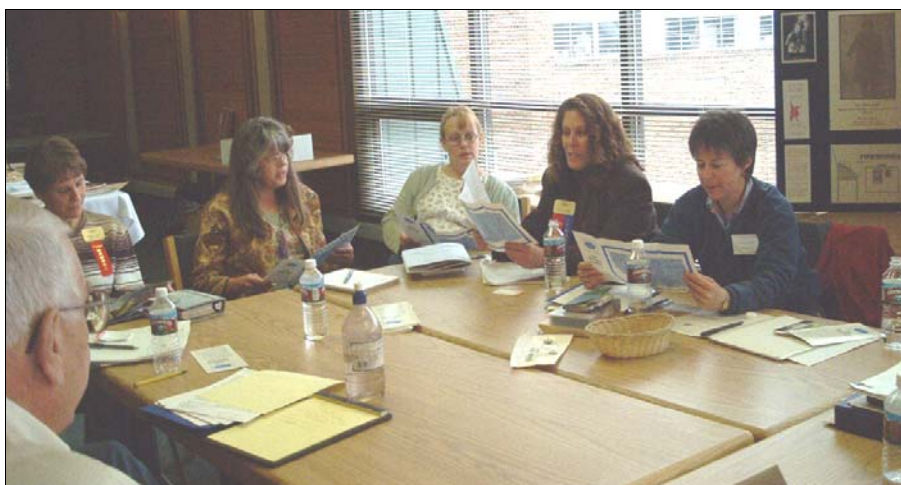
MAM Board meeting in Butte, Montana in 2002